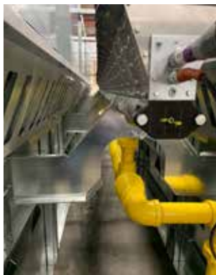
Electric spark ignition