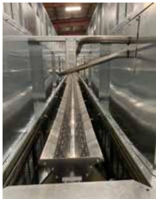
Burner with internal vaporizer